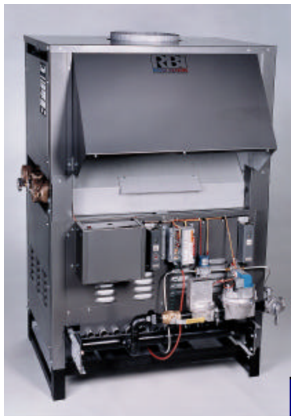
Above: RBI 8900 Series Hot Water Heater w/ Bronze Header.